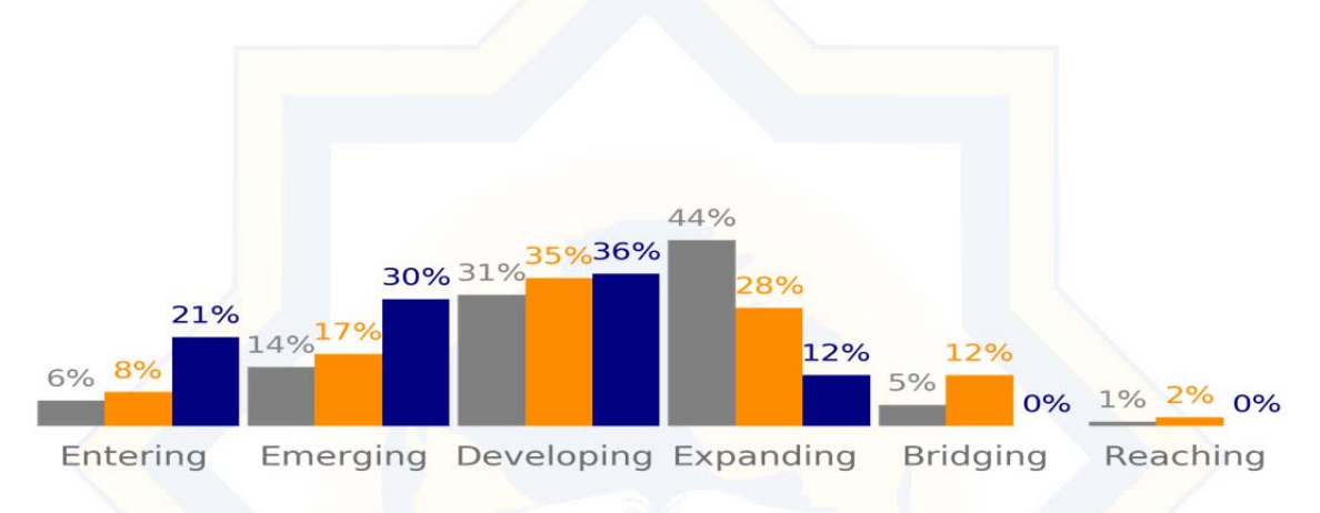
2015, <mark>2016</mark>, and 2017 WIDA Composite Levels

Data tables below provide trend data related to WIDA proficiency levels overall. This was the third year of WIDA testing. The following results are from the spring WIDA Access for ELL (English Language Learner) students. "Reaching" or "Bridging" are considered proficient per the chart below